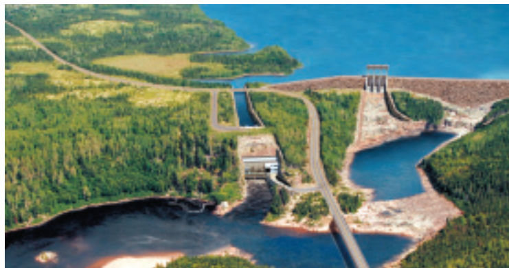
Romaine-1 development (simulation)