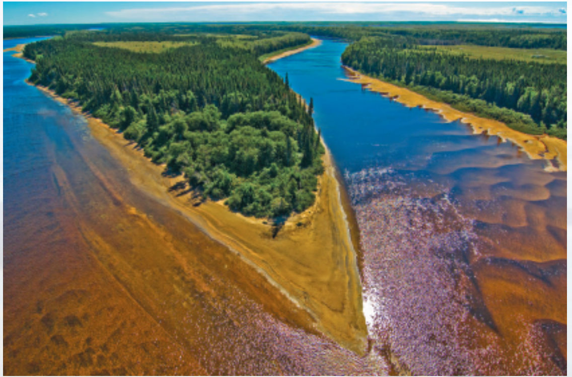
Even with the generating stations in operation, the lower Romaine will look the same as before. Hunting, fishing and trapping will still be possible on Ile Mistaministukueetshuan.