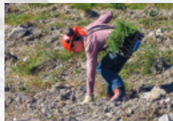
Tree-planting at a former jobsite

Consumption recommendations will be compiled in conjunction with Health Canada and the North Shore Health and Social Services Agency based on the results of regular monitoring of fish mercury levels in the reservoirs.