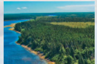
Cottage on the Romaine