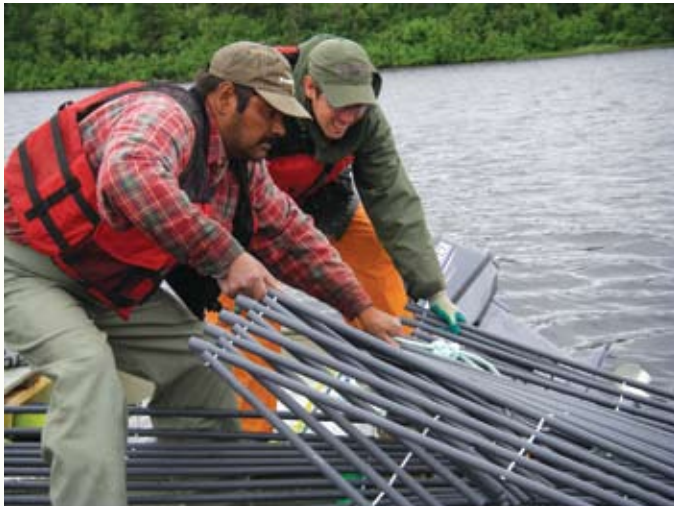
Ka tshikamutakanit ne atatsheikan tshetshi atshimakanit utshashumek u . Innu ka atusset

Neme pishimuss 2009, patetat-tatumitashumitannu auenitshenat tshika atusseuat anite shipit Romaine . Aiat tshika mitshetuak kie eshakumipipuna, tshak tshika nishutshishemitashumitannueshuat ashu nishumitashumitannu nemenu 2014. Tshekat nutim anitshenat ishkueuat kie napeuat tshak atusseht tshika utinikueat nenua atusseutshuapa ka taniti nete etussenanunit. Apu anu tshika ut mitshetiniti ne Hydro-Québec ukupaniema, tetaut