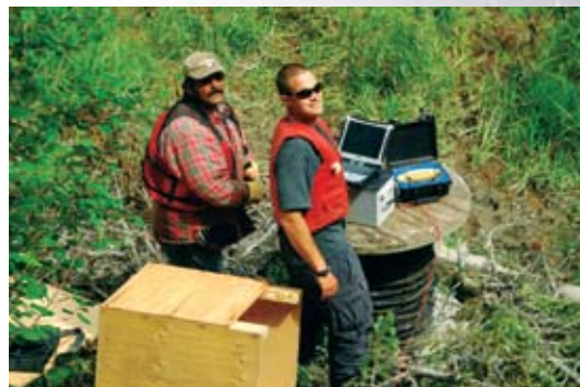
Tshikamutakanu ne tshakuan tshak atshitashutshapanit miam pitutepanitaui utshashumekueat nete ka tshipauakaniht.