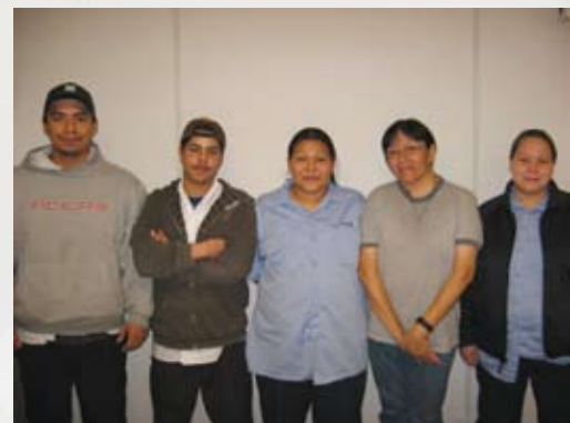
Kaitusseshiht, ekuanitshiunnuat mak pakutshiunnuat, katshishaitsheshiht, ka uaeshtaht tshekuannu eka menupaniti mak ka uitshiaushiht nete peminuenanunit

Nete etussenanut mak anite nepananun, tauat anite auenitshenat etusseht, peikunnetipaikana peikutshishikua. Eukuan ume mani etatussenanun, nishuasht-tatutipaikana tshetshishepaushiniti tshitshipannanu, muk u passe ait ishinakuannu utatusseunau. Kapiminueshiht, mate, mishtauipat uniuat tshetshi aieshkushtaht shetshitshepa-mitshishunanuti, ekue ashteieshkuishiht kiashikaniti tshe minuat natshi-piminueht kashikaniti tshetshi utakuai-mitshishunanunit. Tauat passe kupanieshat tepishkaniti etusseht. Eka etussenanuti, mitshet anite tshekuan tutakanu, anitshenat kupanieshat etusseshtahk nenu mietueuiaht auenua, pinakunitshenanu, tuenua, papamutenanu kie ka tshishkauakaniht tuanat takuan.