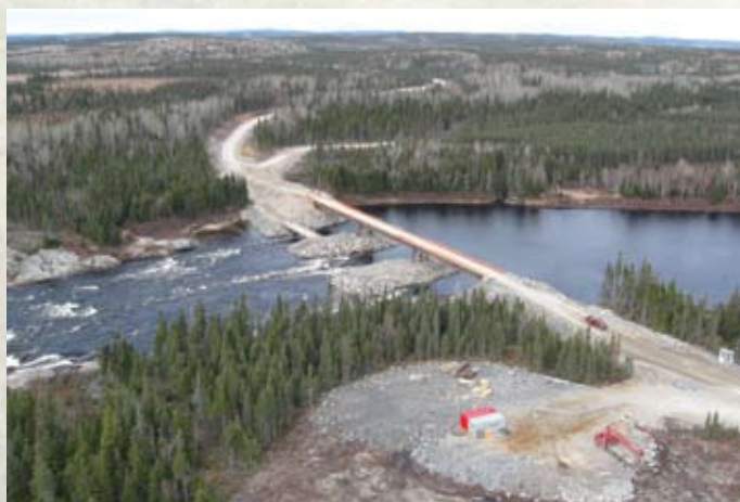
Ashukan eka natshishk tshe takuak

Eshk U tutakanu meshkanau tshe itamut nete tshe atussenanut. Shash nete tshi pimipatananu, 40 km ishkuumtshe ne meshkanu. Muk U tshetshi eka auen ushukuiakaniht, anitshenat kupanieshat etusseht nete nanimissiu-ishkutenu etutakanniht, eukuan muk U manakaniht tshetshi pimipaituht.