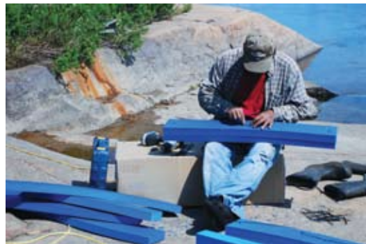
Tapititau mussipeunakana tshak tshikamutakaniti nete ka tshipashkuauakanit utshashumek u .

nenua etashiniti auenua, tetaut nenu minuat tshika itashinua. Muk u , uin nenu iapit atusseunnu tshika nakatuapatam u kie kupaniesha tshetshi eka ushikuiakaniti, tanite uin nenu tipenitam u .