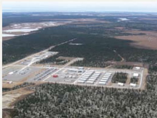
Anite mianukashunanut nete km 1