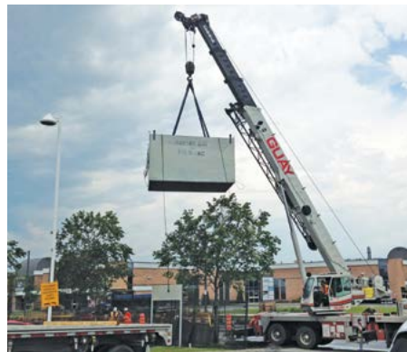
6. Installation of cable vault