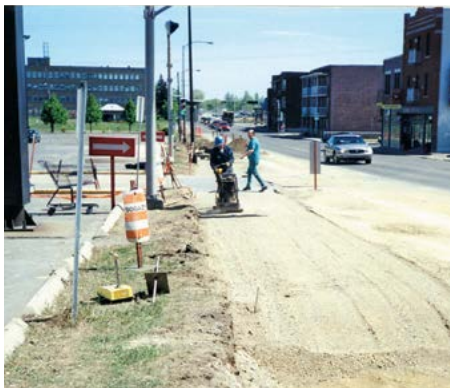
5. Backfilling and resurfacing