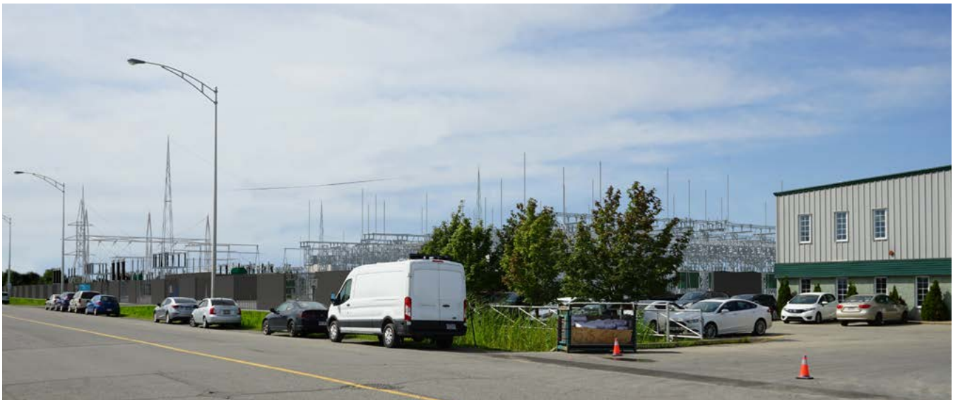
Visual simulation of Patriotes substation

A temporary increase in traffic is expected around jobsites owing to heavy vehicles hauling materials back and forth and other things, particularly on Boulevard Albert-Mondou, Boulevard Arthur-Sauvé, Chemin de la Rivière Nord and Chemin de la Rivière Sud, in Saint-Eustache. In addition, parking will be prohibited on Boulevard Albert-Mondou during the work.