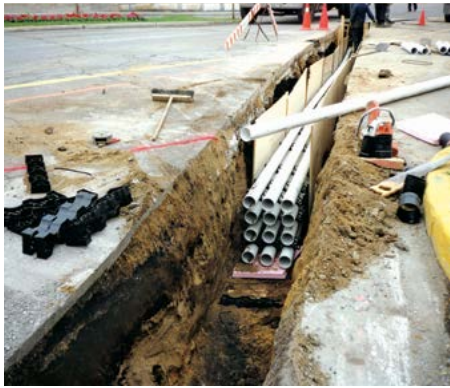
3. Installation of formwork for pouring concrete