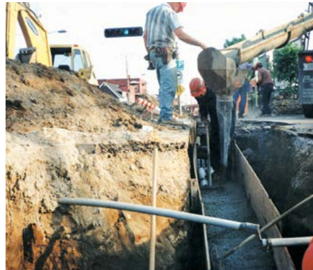
4. Pouring concrete around duct bank