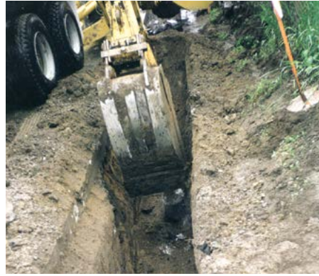
2. Construction of trench to hold duct bank