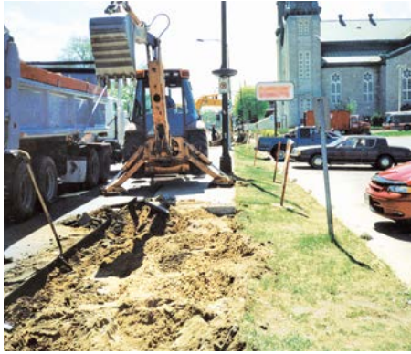
1. Excavation of the sidewalk