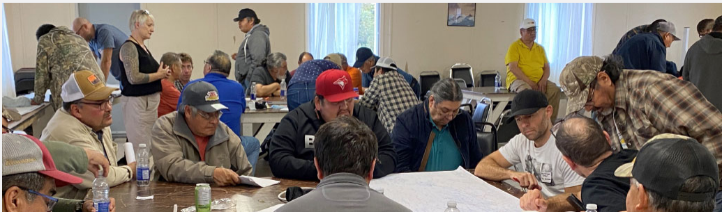
A workshop was held on September 17, 2024 with 34 tallymen representing 20 traplines aimed at getting input early in the planning stage for the environmental study program.