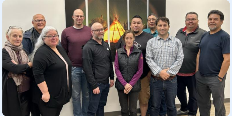
The Technical Table is comprised of representatives from the Cree Nations of Chisasibi, Wemindji, and Mistissini, as well as Hydro-Québec.

The Ayimihituunaanuwich joint process established the creation of the Main Table and the Technical Table. The Main Table is a forum for cooperation and oversight of the Joint Process and a possible collaboration agreement. The Technical Table is supervising the environmental study program to evaluate the potential environmental, social and cultural impacts of the potential upgrades.