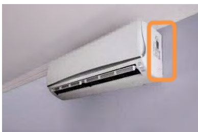
Illustration of the location of the label on an indoor unit of a wall-mounted, ductless, air-to-air mini-split heat pump.