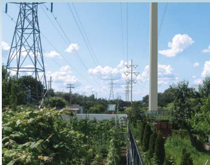
Planned line (simulation)