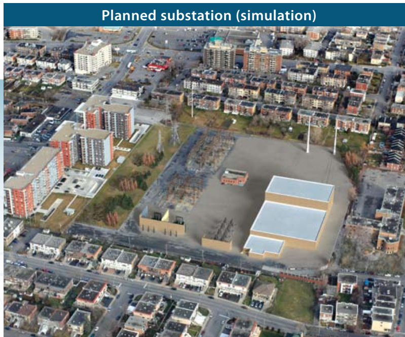
Planned substation (simulation)